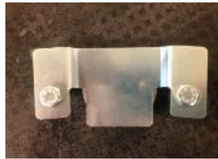
Open end left side facing